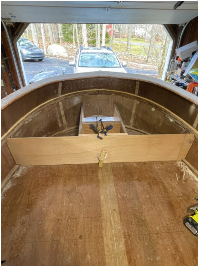
The outboard conversion required a motor box and an opening cut into the stern and hull bottom for the lower unit.

I built a wheeled platform to serve as the foundation for building the hull, and construction of my Candu E-Z began with the hull's bottom and keel. Since I was working in the garage, this platform allowed me to easily move the project outdoors whenever I needed more space to work on it. The bottom panel is cut out of four sheets of 1/2" plywood, butted together and glued with thickened epoxy, reinforced with fiberglass tape embedded in a routed-out channel to accommodate the single layer of tape without adding to the thickness of the joint.