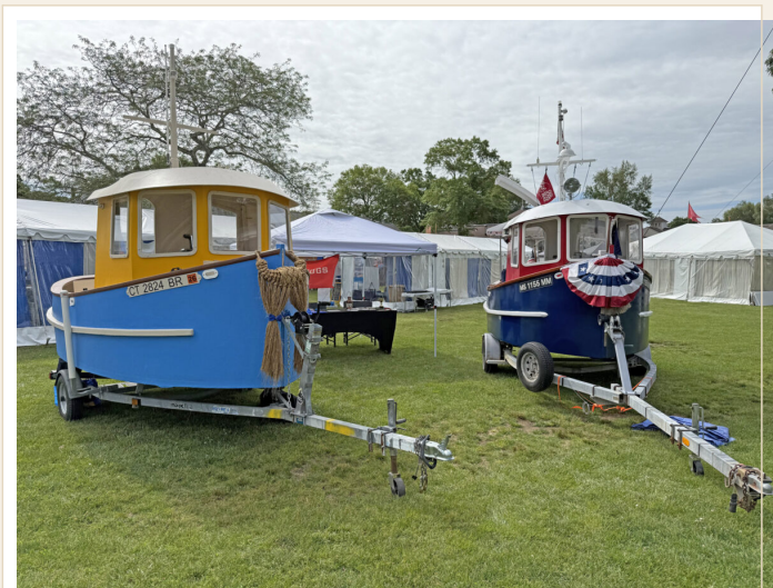
AWOOGA and TOOT-TOOT together at the 2025 WoodenBoat Show at Mystic Seaport.

AWOOGA and TOOT-TOOT were together at the 2025 WoodenBoat Show at Mystic Seaport. To fit on a standard 8' 6"-wide trailer, the Candu E-Z - with a beam of 7' 4" - must be elevated above the fenders.