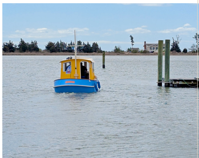
The Candu E-Z creates very little wake at any speed; on windy days the high sides and cabin require attentive steering.

Boarding the boat is effortless. With its generous beam offering excellent stability, and bench seating that doubles as a step in the cockpit, climbing aboard is easy. People moving around the boat can, of course, affect trim and balance, which in turn mildly influences steerage, but with ample seating, adjustments are easily managed.