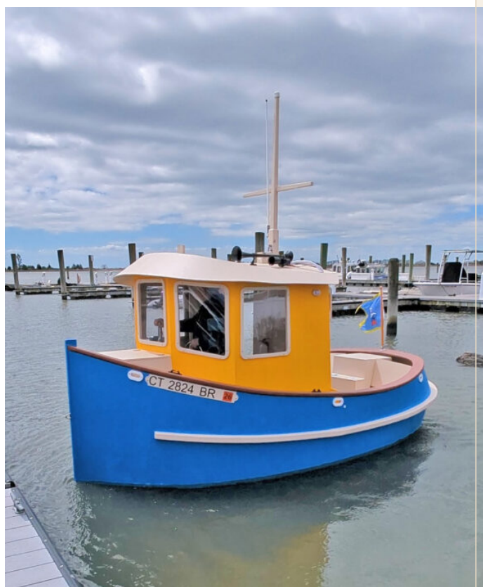
On the water, the Candu E-Z is every inch a mini tug: substantial rubrail, jaunty cabin, and a sheer that sweeps from high bow to low stern.

One modification I made concerned the folding mast. The original plans called for a mast that runs from the cockpit sole to a hinge at cabintop level, but to raise and lower it would require balancing on one of the narrow side decks. Instead, I put the break in the mast below the cabintop at about my shoulder height, and mounted the hinge on a block just above the cabintop to create a lever between break and hinge that can be easily reached to raise and lower the mast from the cockpit.